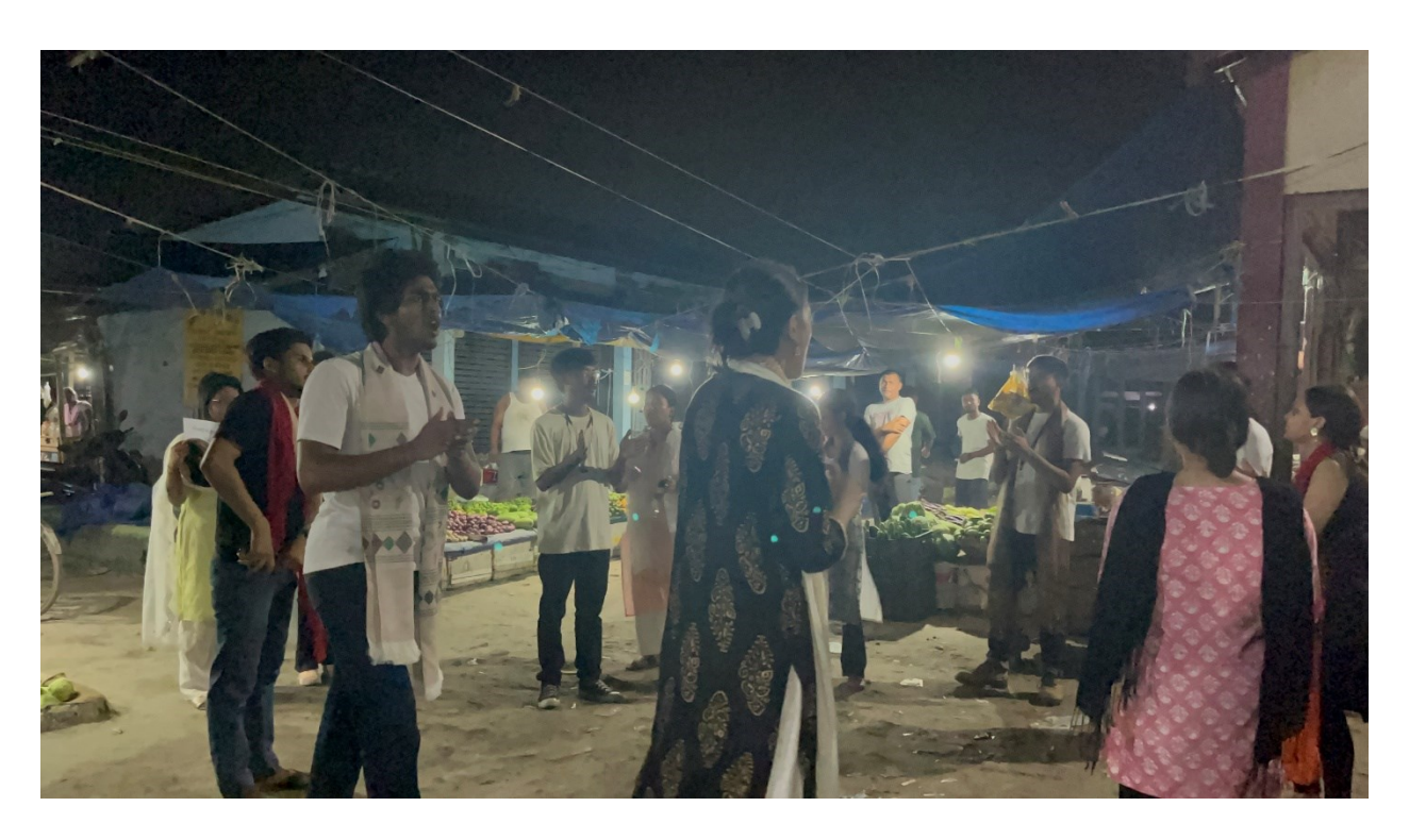
REPORT OF PRO BONO LEGAL SERVICES CLUB (MINISTRY OF LAW AND JUSTICE)