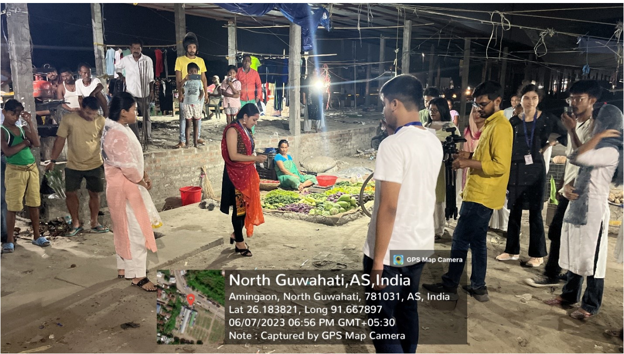
Nukkad Natak on Domestic Violence