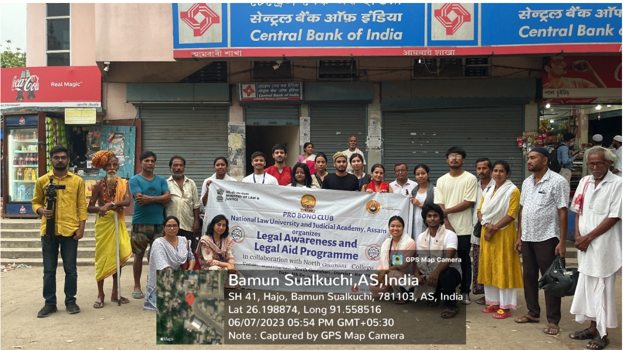
Nukkad Natak Skit in Sualkuchi, Singimari